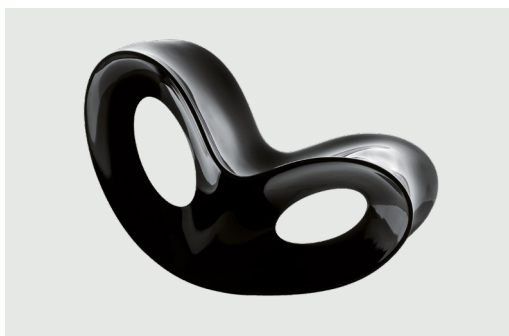
Glossy Black 1763 C