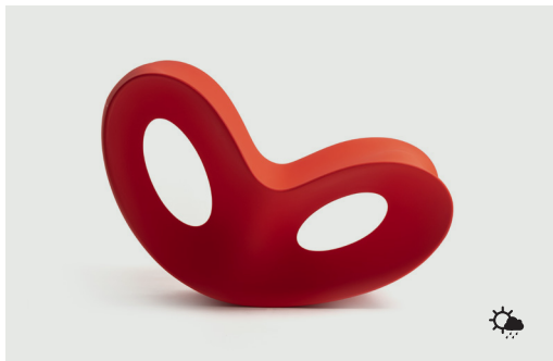
Red 1004 C