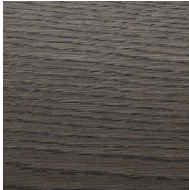
C76 OAK GRAFITE