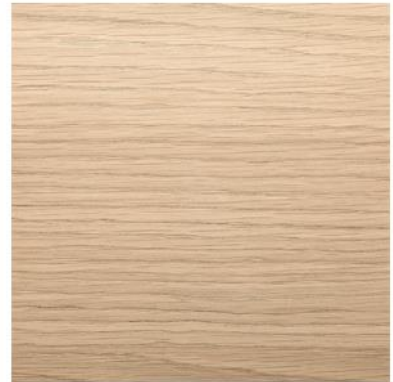
C88 NATURAL OAK