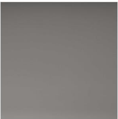
A18 OSSIDIANA OPACO