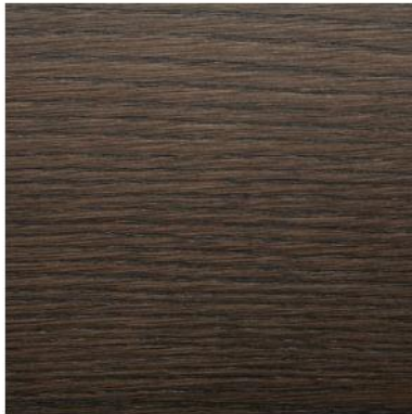
C68 OAK MORO