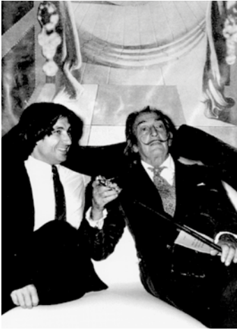
SALVADOR DALÍ OSCAR TUSQUETS